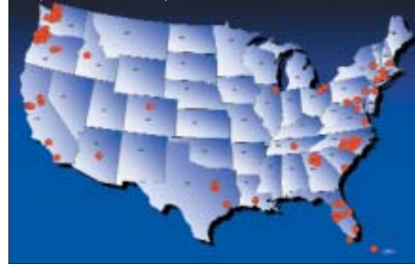
Heery Has More K-12 Project Management Experience Than Any Other Firm in the Nation.

whether you're a designer, program manager, construction manager, engineer, or one of our specialists in logistics, commissioning or transition management, these facts are part of your corporate inheritance. Take the quiz on the back page after reading this to see how many “bragging rights” you remember.