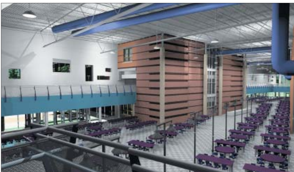
Architect: Flansburgh Associates

■ The Heery Transportation Group has been selected for an indefinite quantity contract with the Federal Transit Administration (FTA) to provide project management oversight services for a number of projects funded by FTA, with construction costs ranging from $30 million to $1 billion. Potential projects include rail modernizations, new rail construction and other major capital transit systems, such as bus or ferry. This win is significant – it increases Heery's visibility in the growing transportation sector.